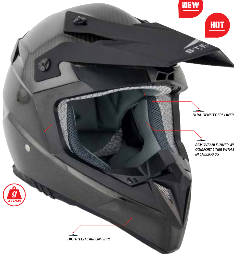
DUAL DENSITY EPS LINER