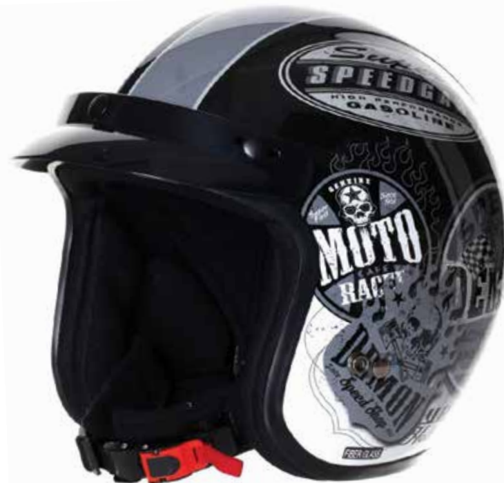
OLD SCHOOL MONO