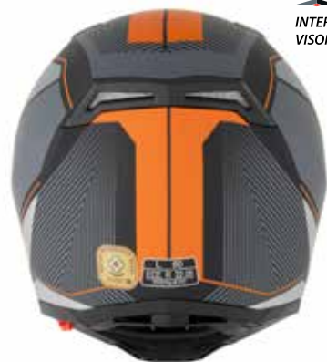
INTERIOR DROP DOWN VISOR