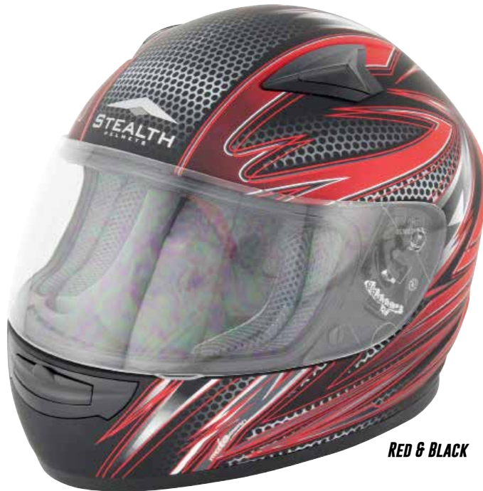
RED & BLACK