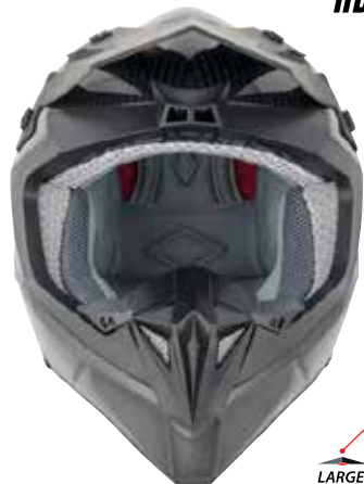
LARGE EYE PORT