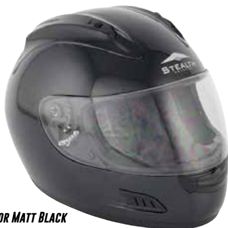
GLOSS BLACK OR MATT BLACK