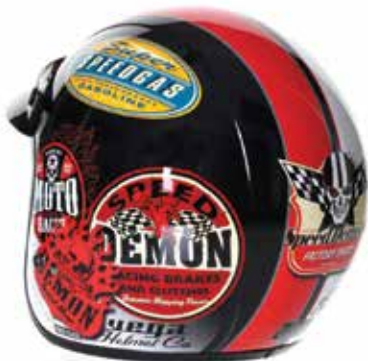
OLD SCHOOL COLOUR